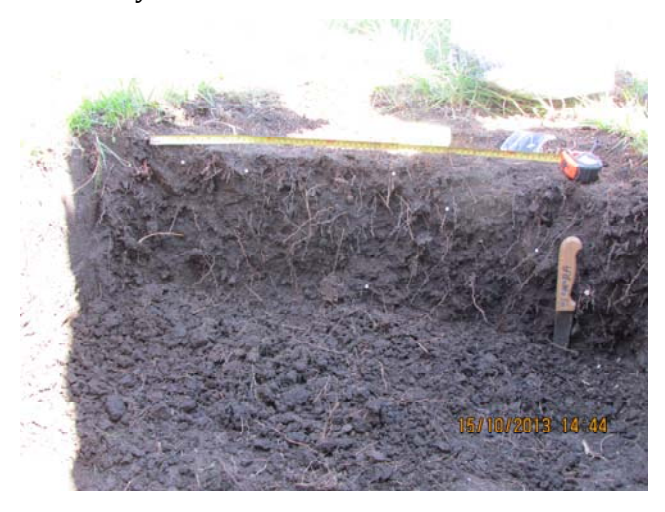
Soil profile under native pasture

From 14 to 16 October, the Uruguayan society of Soil Science (SUCS) and the UDELAR organized a meeting that was held in Paysandu, Uruguay. More than 20 participants, researchers and post graduate students discussed the implementation of the cultural profile method and compared visual description of soil structure under no-till and tillage situations on the experimental station of the University.