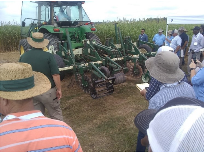
Demonstrating crimping system for cover crop management at the US Southern Cover Crop Council meeting.