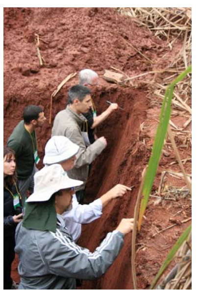
Line up for inspection