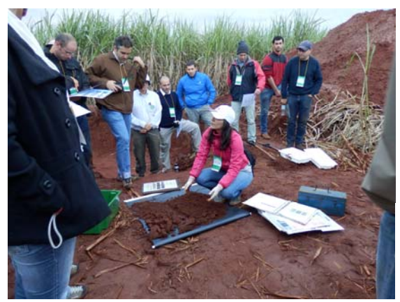
Methods explained at the surface