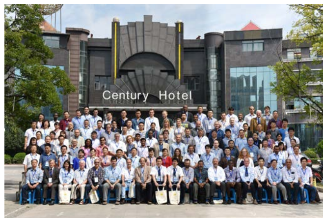
Group photo from the opening day of the conference

Unfortunately, the number of participants was lower than initially expected due in part to the large number of competing meetings to celebrate International Year of Soils. The conference included two mid-week tours: one to the FACE station and the other to the Changshu field station.