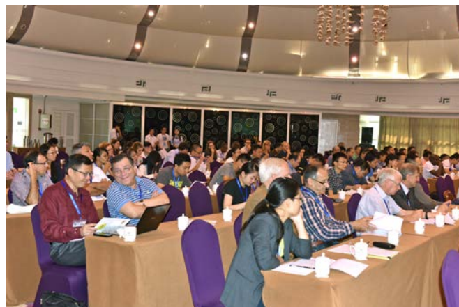
Conference participants attending an oral presentation