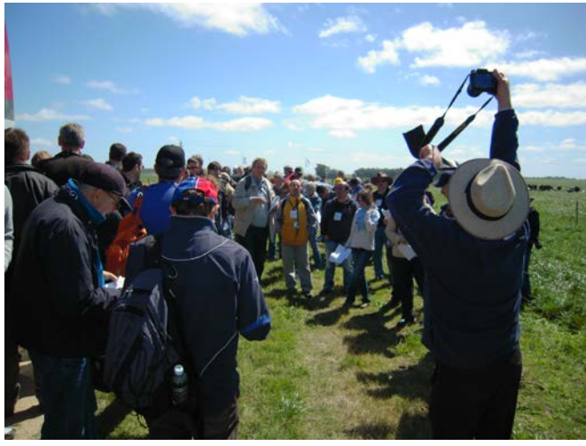
Alongside the dairy paddocks.

Site 3 considered the role of supplementary irrigation. The area of grain crop in South America has increased dramatically in recent years. The scale of the change is staggering with the area of soybean planted in Uruguay going from 9,000ha in 1998 to over 1,000,000ha in 2011! Adoptions of notill, glyphosate-resistant genotypes and favourable prices have all driven the increase. Soybeans grown as a summer crop are highly dependent on stored soil-water and the possibility of supplementary irrigation to decrease yield variability is a major interest for farmers.